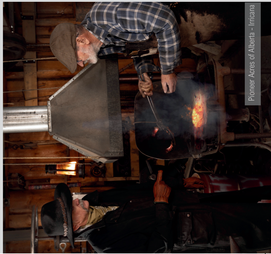
Pioneer Acres of Alberta - Irricana

Central Alberta is part of the North American Great Plains and home to the Blackfoot and Cree peoples. Both the Blackfoot and Cree were hunter/gatherer nomadic peoples who followed the migration of the buffalo (bison), their main food source. Today the museums of CARMN are located on Treaty 6 and Treaty 7 territory as well as several Districts of the Métis Nation of Alberta.